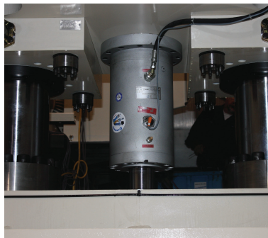
Slide Safety Clamp