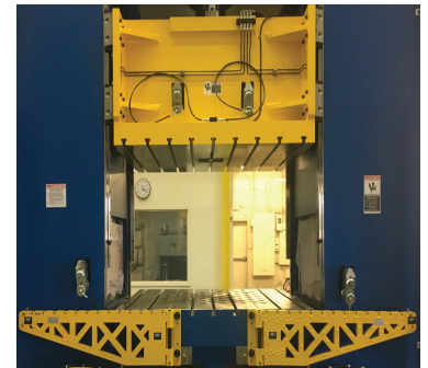
Quick Die Change